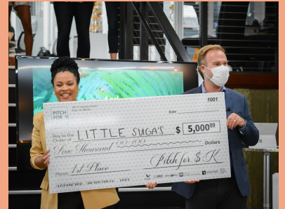
Little Suga's takes top prize at competition for Flint entrepreneurs