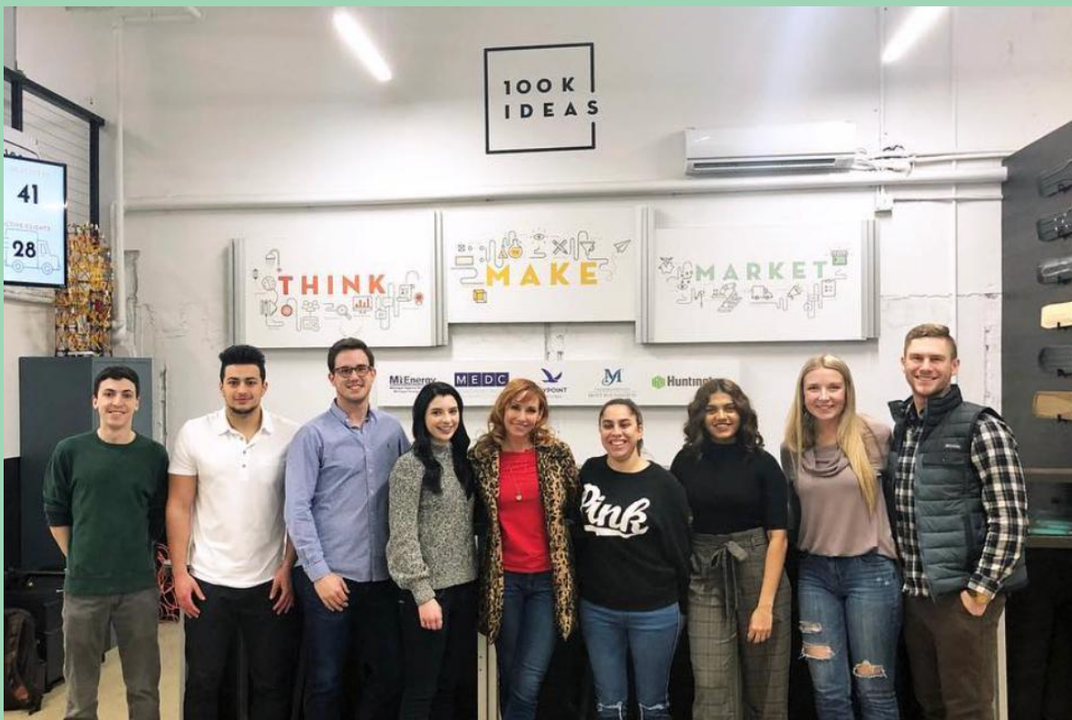
Kari Byron from Myth Busters visited 100K Ideas and spoke with some of the staff.

100K Ideas categorizes presented ideas into three categories: products, services or software/applications. We track services provides as follows: the idea stage comprised of a 30 minute free intake session to discuss the client's idea, a full binder assessment including concept art, research & benchmarking, market analytics and possible next steps , and work orders which can be for an array of services offered including prototyping, branding or product distribution.